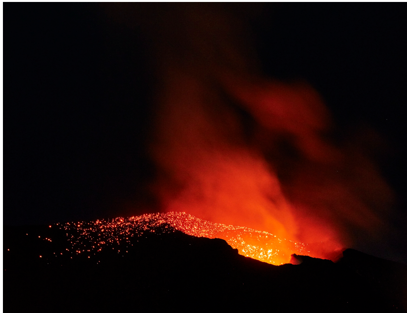
Omar Sartor, Stromboli, 2019